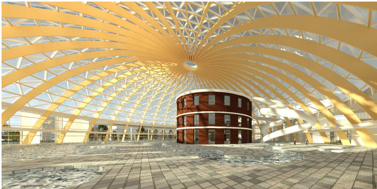
Figure 2. A project of a dome of the water park (author: V. Chugreev).

In March 2015, the «Plan of a step-by-step implementation of BIM technologies in the field of industrial and civil construction» was approved by the order of the Ministry of Construction and Housing and Communal Services of the Russian Federation.